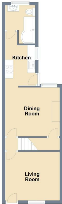
Ground Floor Approx. 34.2 sq. metres (368.0 sq. feet)